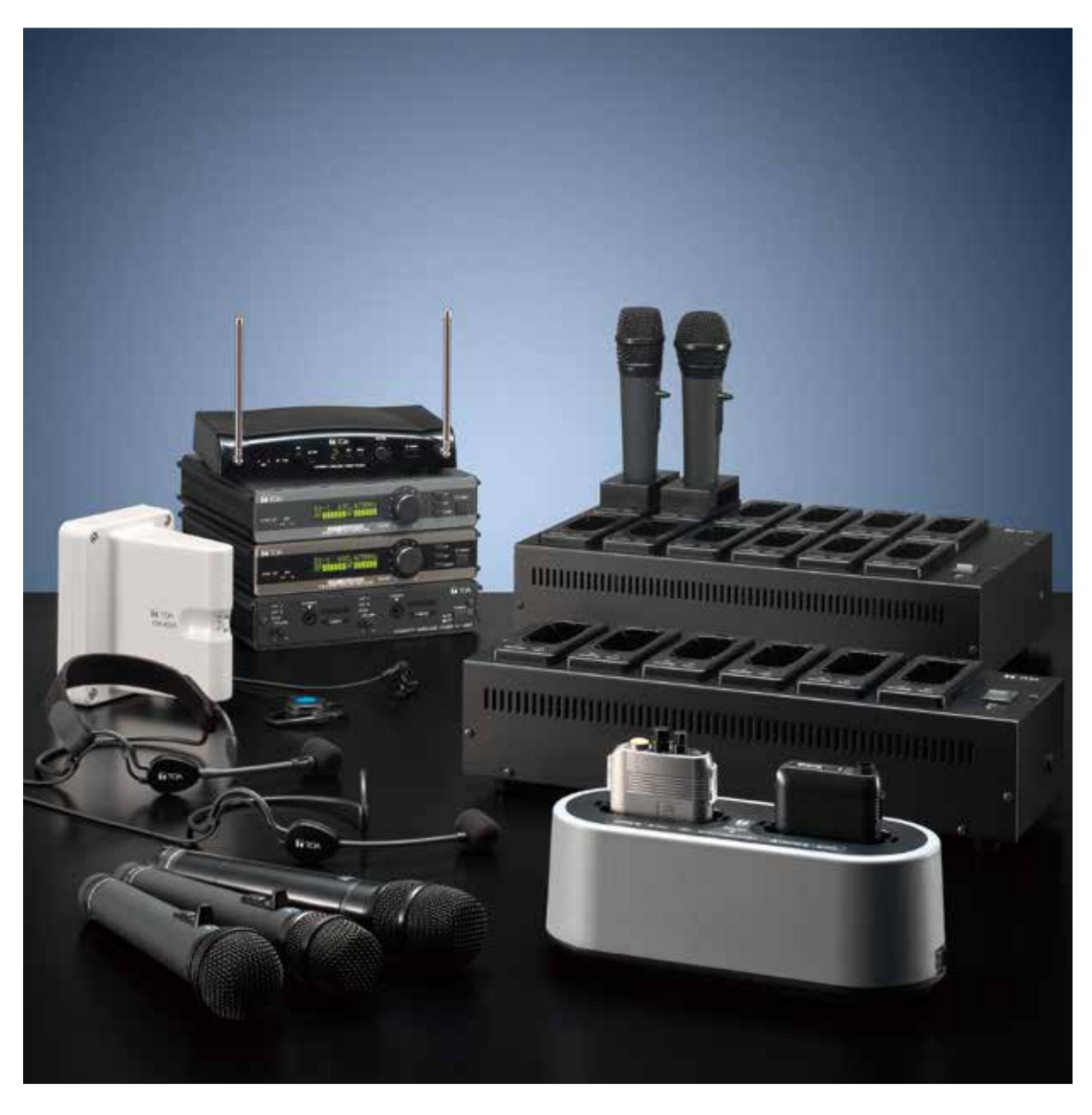
Wireless Convenience with Newly Enhanced Versatility, Reliability & Cost Efficiency